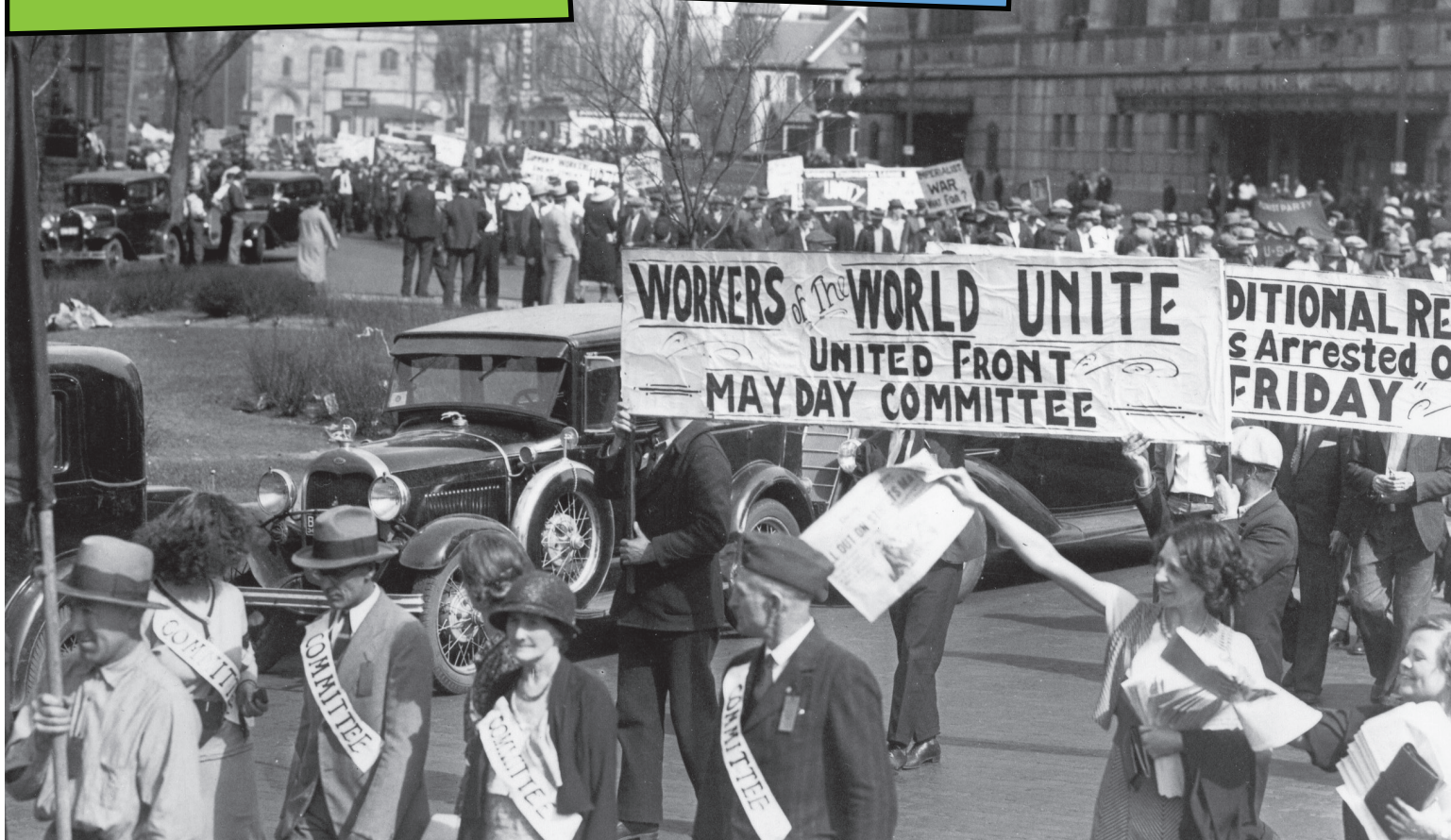
PHOTO: MAY DAY PARADE, MAY 2, 1934

May Day is recognized internationally as Labor Day to honor working class people and labor unions with parades and marches throughout much of the world. The Minneapolis Central Labor Union invited all trade unions, political, fraternal, other organizations and the unemployed to demonstrate in the 1934 May Day Parade.