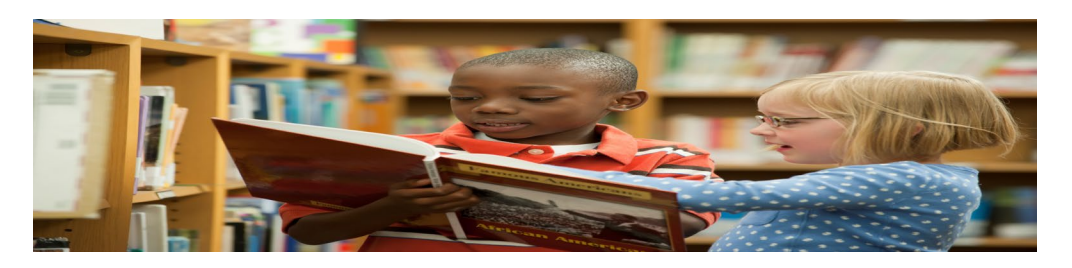
June 22-27 — Public Library Association (PLA) Conference, Chicago, IL