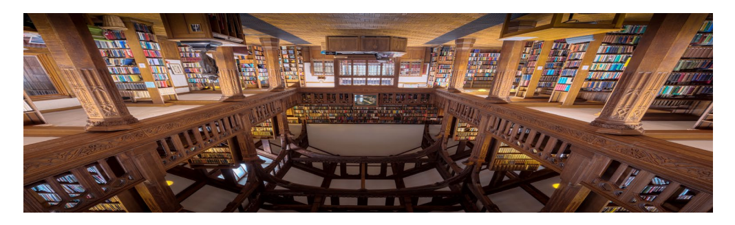
October 15-21 — National Friends of Libraries Week