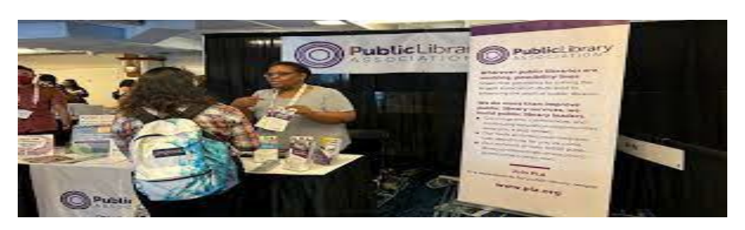
June 22-27 — ALA Annual Conference, Chicago, IL